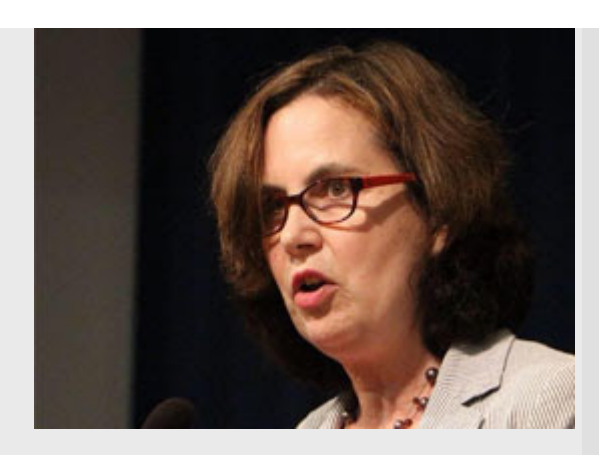
Alberta workers win new rights with overhauled health and safety provisions.