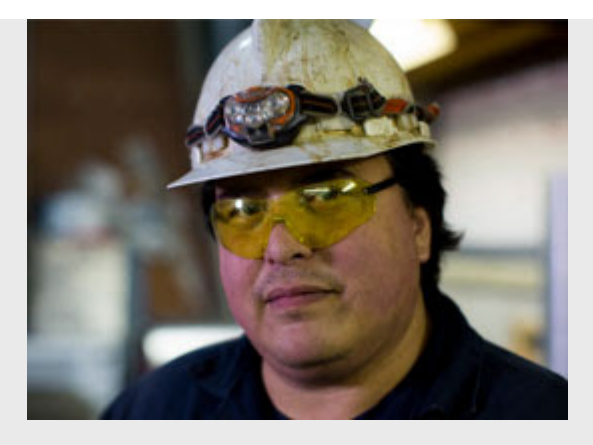
Get the facts about Unifor's legal challenge to Suncor's invasive and unfair random testing.